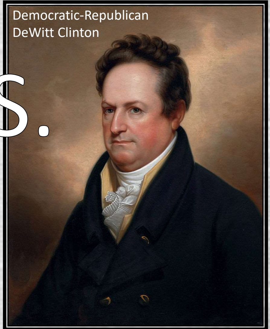
Democratic-Republican DeWitt Clinton